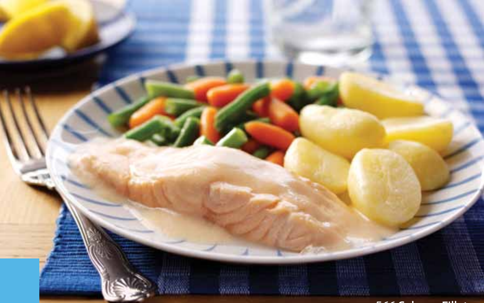
566 Salmon Fillet in Seafood Sauce Page 32